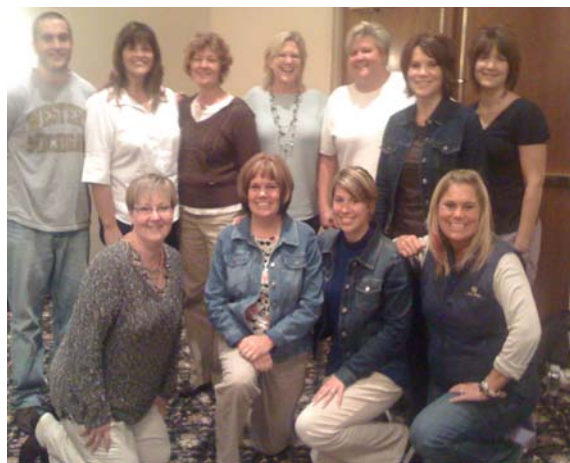
Beardsley Elementary School Leadership Team